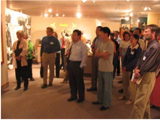
Guided tour through the Herbert Hoover Presidential Library and Museum.