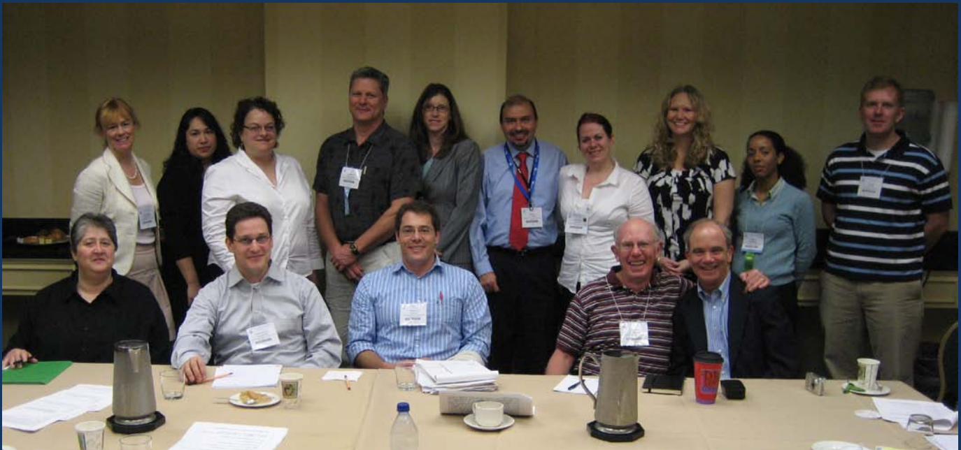
Members of the Respiration Section Steering Committee