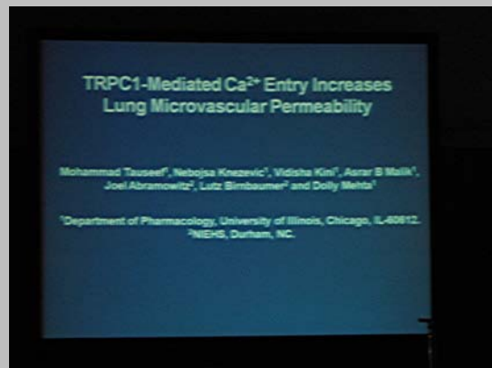
Title of a talk at a symposium sponsored by the Respiration Section